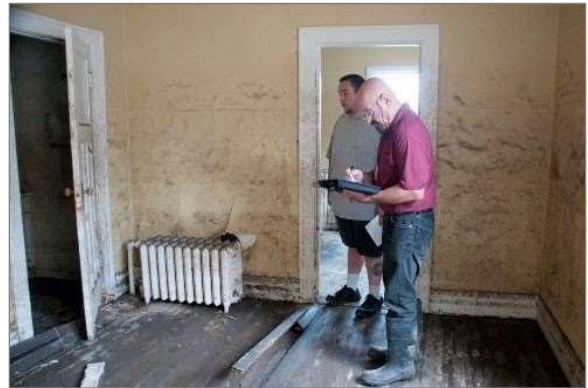
FEMA inspector records disaster damage at a survivor's home.

Eligible essential tool items are listed below: